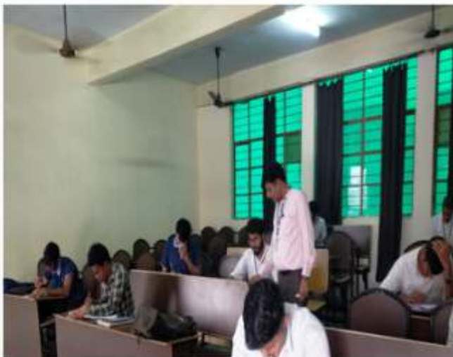
A Glimpse of the Activity