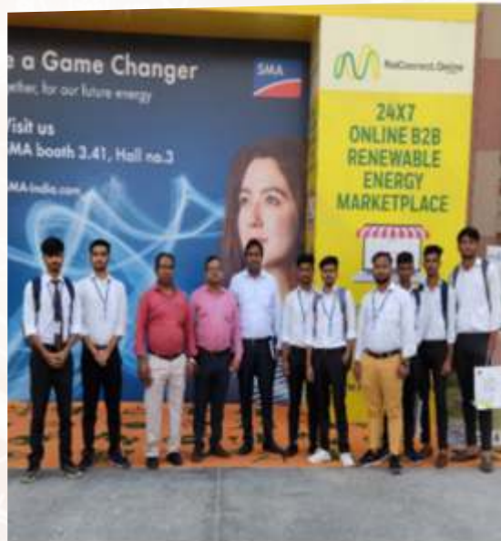
Students and Faculty During Field Visit