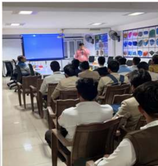
Industrial Visit at Nilkamal Ltd Greater Noida