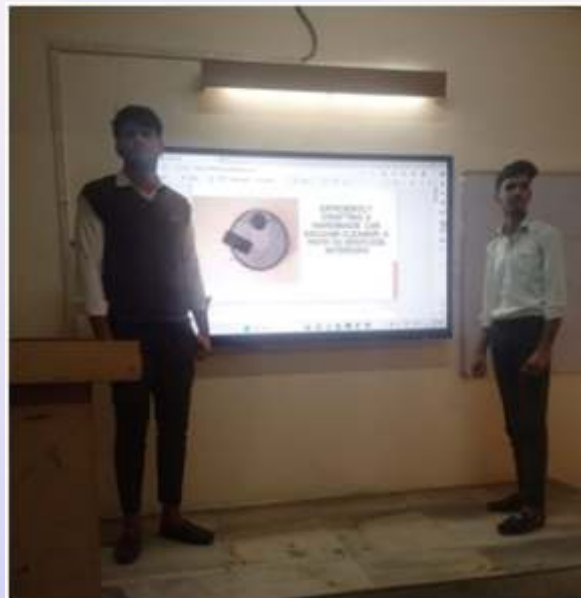
Innovative Idea Presentation in Progress