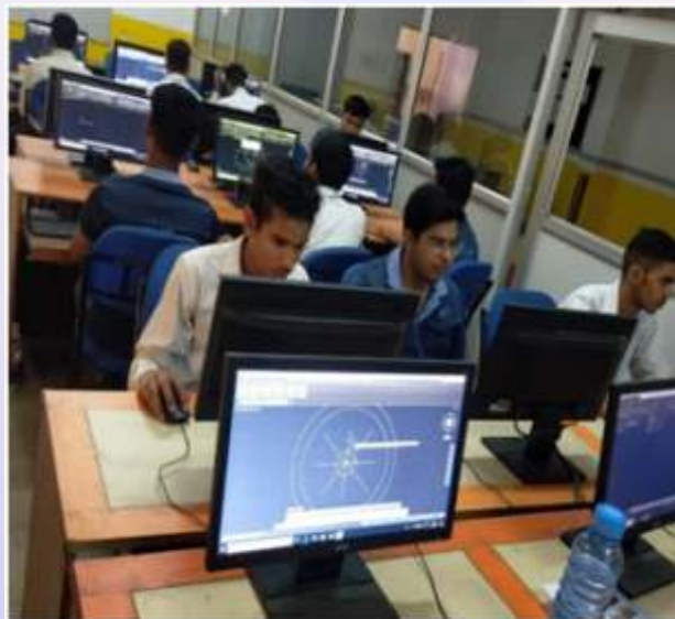
Participants During Design Competition