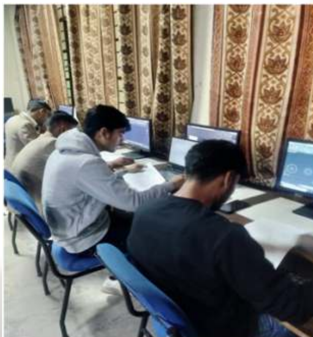
Drafting on AutoCAD Software/CATIA V5 in Progress