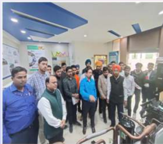
Industrial Visits at Emerson Cold Chain Center, Gurugram